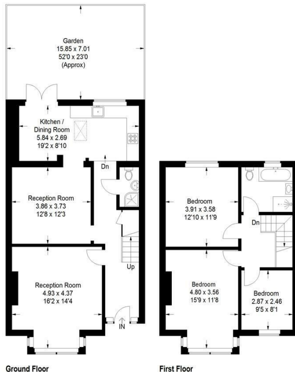
Illustration for identification purposes only, measurements are approximate.